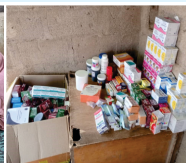
A collection of some of the drugs that were given during the outreach.