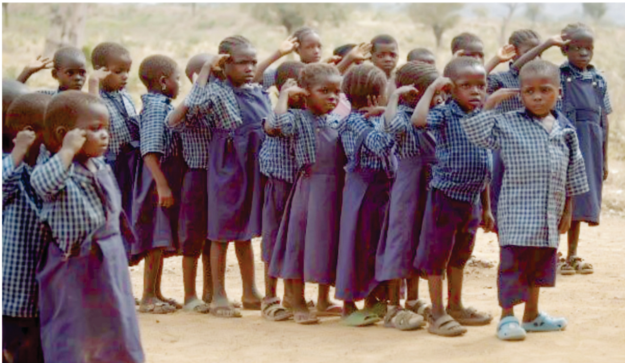
The children reciting the National pledge.