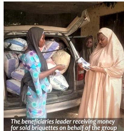
The beneficiaries leader receiving money for sold briquettes on behalf of the group

This enlightenment spurred a communal movement towards environmental conservation,