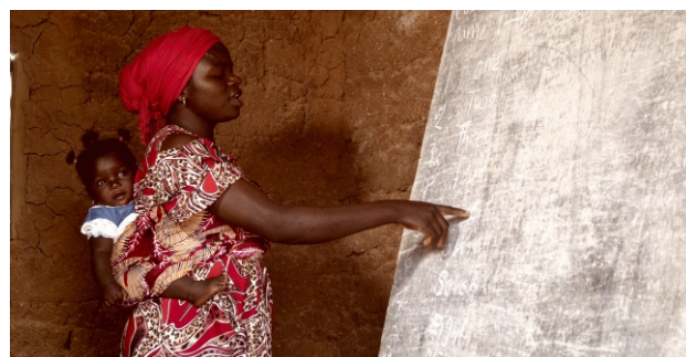
A teacher teaching the children alphabets.

The success of Hanani's educational initiative is a powerful reminder of what can be achieved when a community unites with purpose and determination. Children who once waited until the age of 10 to start school now embark on their educational journeys much earlier, paving the way for a brighter future. The villagers' monthly contributions have created a