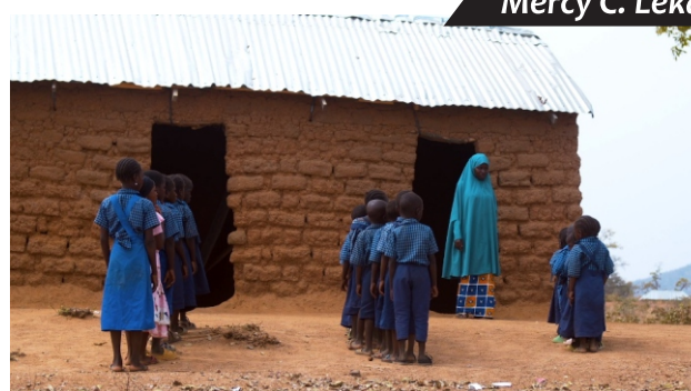
The children of Hanani during an assembly meeting

However, the arrival of DEC through the CQIT formed by the Good Governance Unit sparked a revolution. Determined to change the status quo, DEC's intervention became the catalyst for a remarkable transformation. Inspired by the possibility of a brighter future, the people of Hanani united with a common goal: to bring education to their village. Through sheer determination and