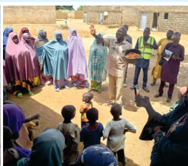
The women being addressed by a DEC staff before the commencement of the outreach at Sara Community in Jigawa State.