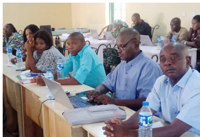
Cross section of participants at the event.

DEC's journey towards economic empowerment isn't just a story—it's a narrative of resilience, innovation, and collective ambition. As stakeholders depart, they carry with them not just plans but a shared commitment to nurturing growth and planting the seeds of a brighter future.