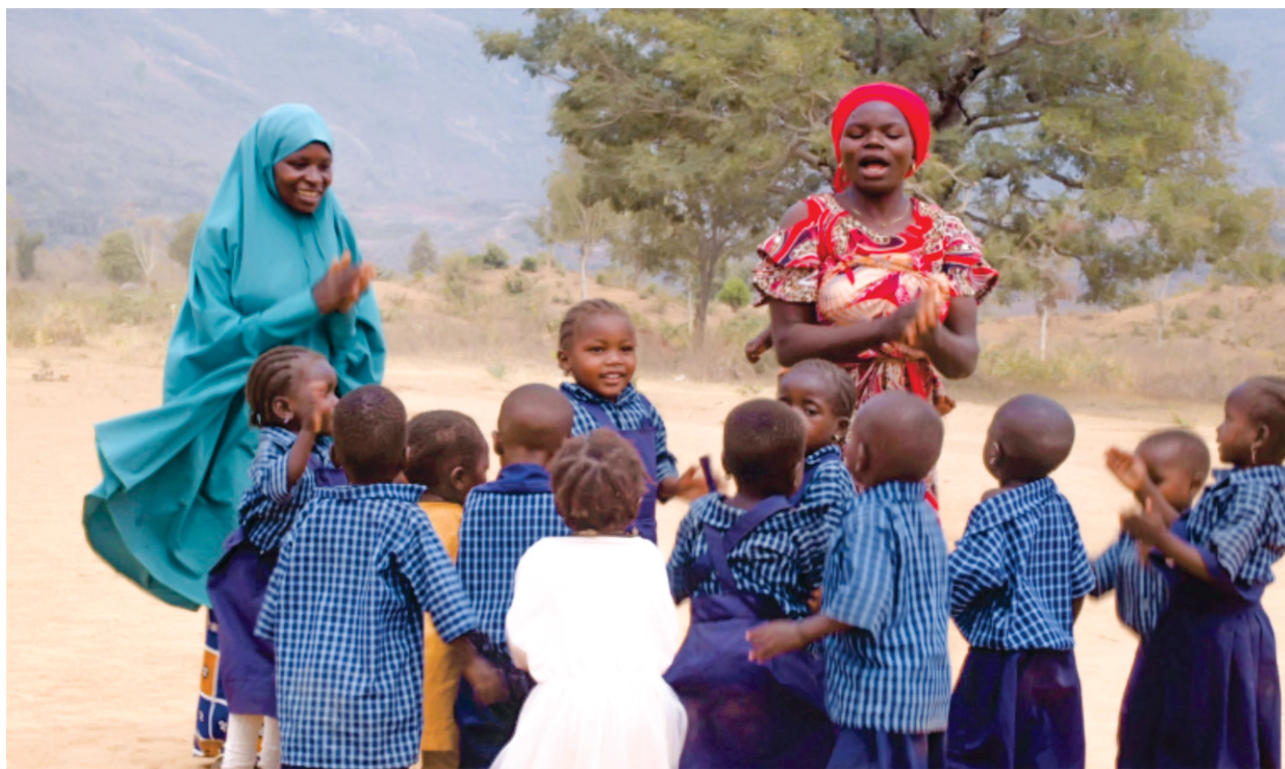
The children being taught a nursery rhyme by the teachers

Hanani's journey from educational darkness to enlightenment is a compelling testament to the power of community spirit and the far-reaching impact of DEC's intervention. By uniting to build classrooms and support volunteer teachers, the people of Hanani have not only transformed their village but have also lit a path for other communities to follow. This story of collective effort and perseverance is a shining example of how even the smallest villages can achieve great things when their hearts and minds are set on a common goal.