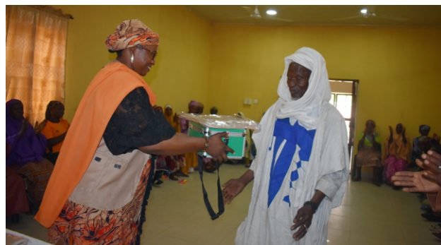
The ED of DEC handing over a first aid box to a community head