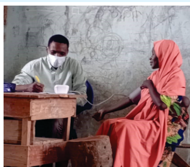
The consultant checking the bp of a patient at the outreach at Taka Lafiya Kano.

From the remote corners of Taka Lafiya in Kofar, Kura LGA, to Sara, Sindimina (Kwatia) in Birnin Kudu LGA, Jigawa State, DEC's initiatives have become a beacon of hope and healing. Their efforts resonate deeply, nurturing vulnerable populations with grace and determination, thereby enriching lives and fostering sustainable progress. DEC's strategic focus on supporting women reflects not only their acute understanding of local needs but also their profound commitment to creating a more just and equitable future for all.