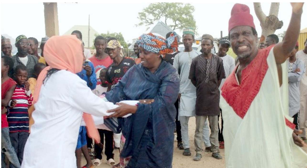
Drama presentation at Baram Dutse community, Bauchi LGA

In the heart of Bauchi LGA, Bauchi State, a captivating drama unfolded across the communities of Wusili, Baram Dutse, Hanani, Ma'as, and Mulang. The performances, vibrant and compelling, were not merely a spectacle but a powerful call to action. Each scene painted a vivid picture of the transformative power of education, particularly for girls.