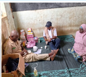
DEC staff attending to a patient at Sara Community.