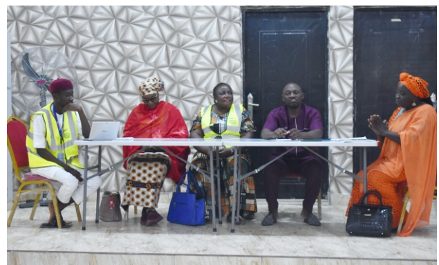
The panel answering questions