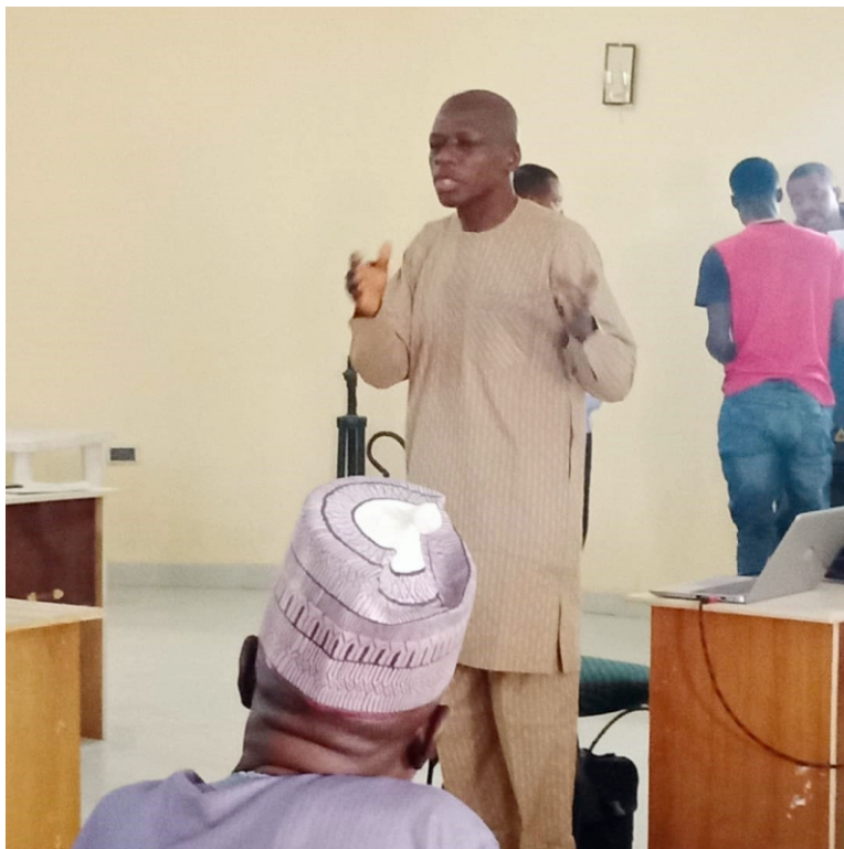
A.g Micro finance of DEC addressing staff during the meeting.

In the serene hills of Plateau State, Development Exchange Centre (DEC) orchestrated a loan review meeting that echoed with the collective pulse of progress. Bringing together a tapestry of stakeholders, the gathering of DEC staff transcended mere discussion—it was a symposium of foresight and empowerment.