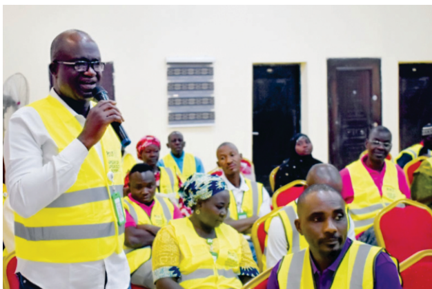
A staff of DEC asking a question