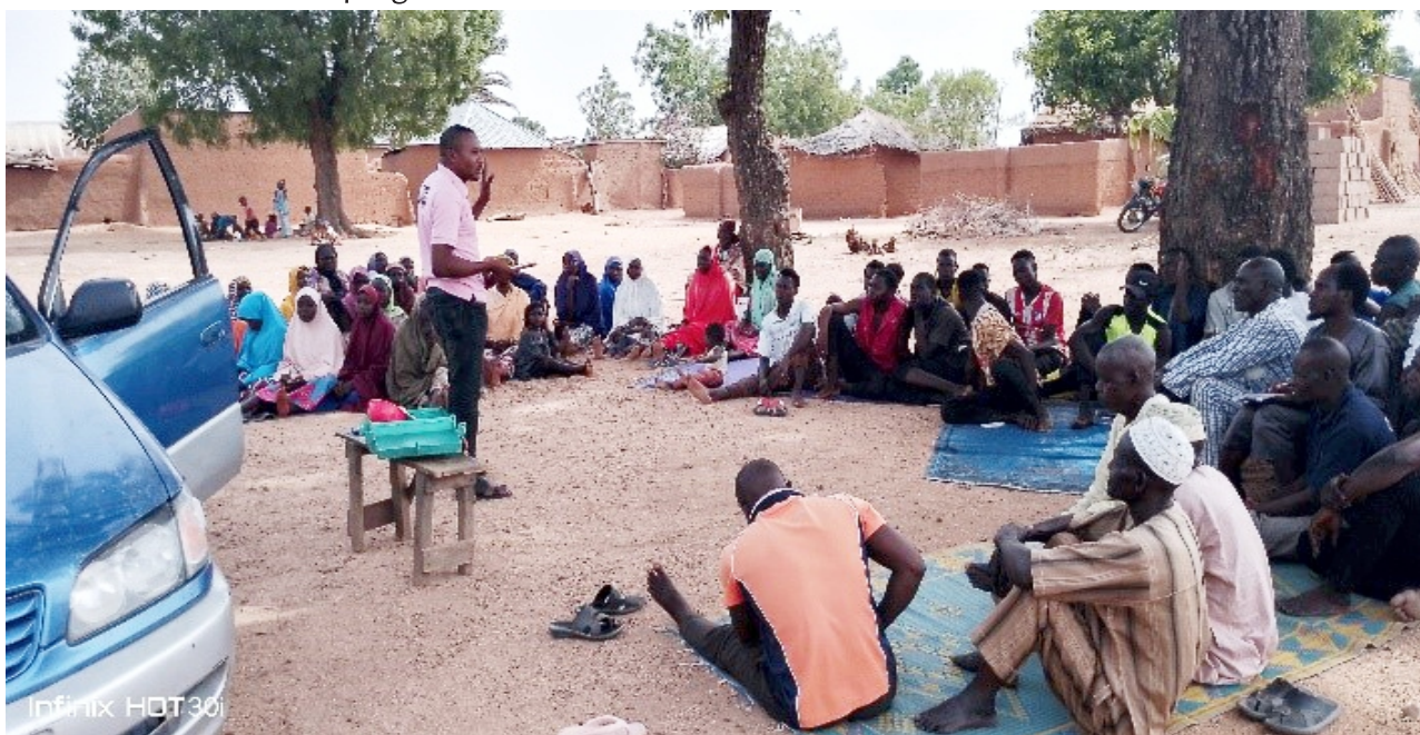
VSLA training at Salahu community Kwaya Kusar LGA, Borno State

These efforts contribute to community development, poverty reduction, and improved financial access, particularly in rural regions. Ultimately, these training sessions help communities build resilience, stability, and the capacity to make investments for their future. Here are few out of the thousands that have benefited from the VSLA program.