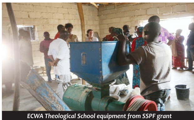
ECWA Theological School equipment from SSPF grant