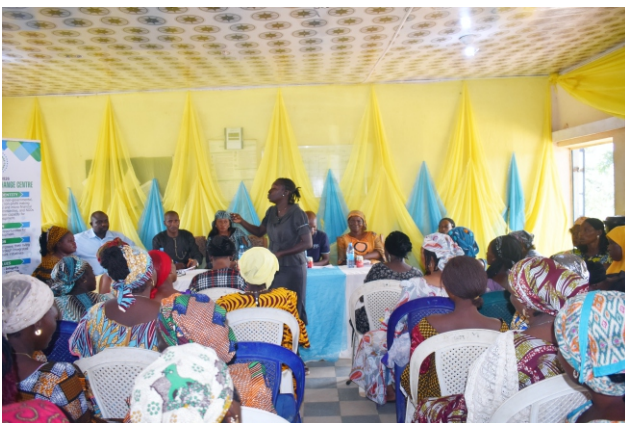
Women council meeting at Kafanchan branch.

The Women's Council meetings in Kafanchan, Kachia, and Kawo provided invaluable insights into the challenges and triumphs of DEC's clients. Addressing the concerns raised, particularly regarding loan approval delays and low initial loan amounts will further enhance DEC's support for women's economic empowerment. The success stories gathered underscores the significant positive impact of DEC's initiatives, demonstrating the organization's crucial role in fostering socio-economic development among women in Kaduna State.