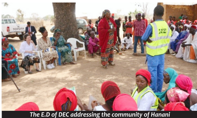
The E.D of DEC addressing the community of Hanani

The day culminated at ECWA Theological College Bayara, where grant-funded machinery symbolized not just progress but prosperity. Discussions reverberated on financial growth catalyzed by