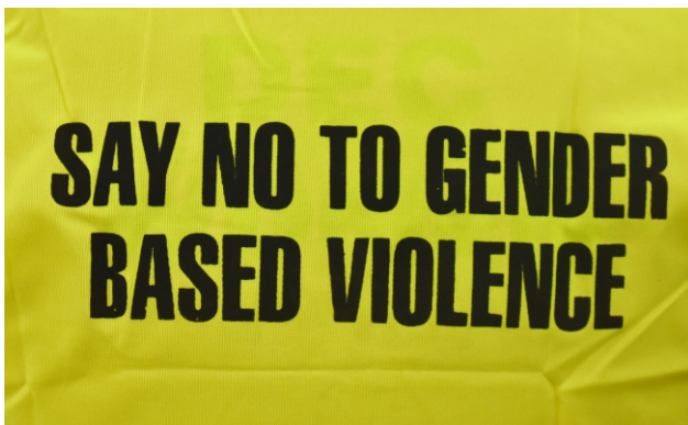
A vest for the occasion

As voices harmonized and pledges reverberated, DEC illuminated a beacon of hope—a testament to solidarity and action. Each speaker's words, each attendee's commitment, forged a path towards a future where fear and discrimination dissolve, replaced by a world where every individual thrives in safety and respect. DEC's leadership on this pivotal day exemplified not just commemoration, but a steadfast determination to catalyze lasting change, ensuring that no woman or girl ever walks alone in the fight against violence.