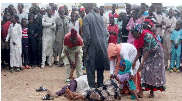
Drama presentation at Hanani community, Bauchi LGA

In Wusili, Baram Dutse, Hanani, Ma'as, and Mulang, the drama did more than entertain—it became a catalyst for change, lighting the path to a future where every girl could shine.