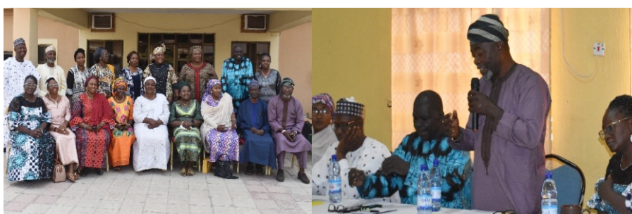
Group picture of the BoD and BoT