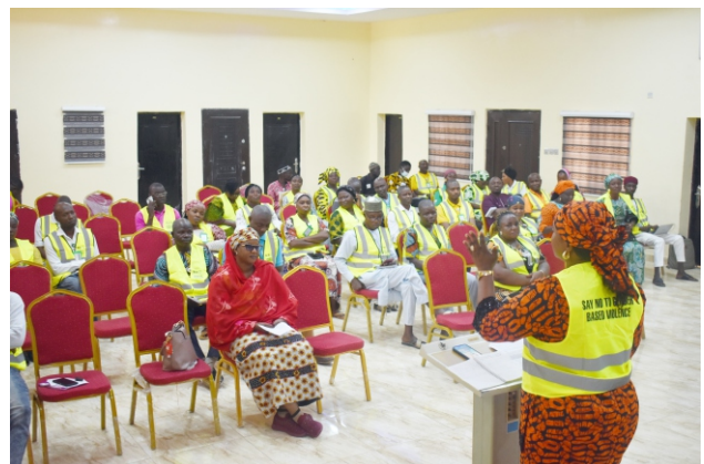
The E.D of DEC addressing all participants