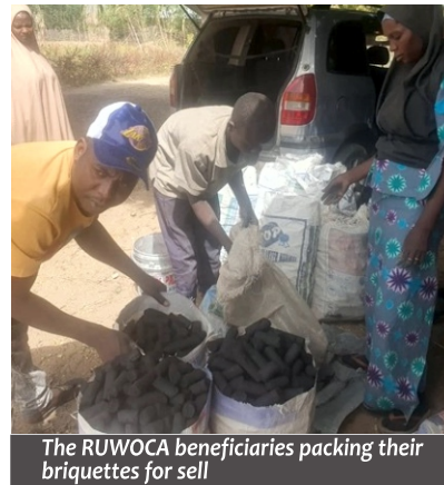
The RUWOCA beneficiaries packing their briquettes for sell

Recognizing the untapped potential of agricultural waste in a community with year-round farming, the Rural Women Climate Advocates (RUWOCA) project introduced an innovative solution: the creation of eco-friendly briquette charcoal. This initiative empowered 20 women through the Village Savings and Loan Association (VSLA), providing them with targeted training in briquette production. Their commitment and effort turned into a sustainable enterprise, producing over